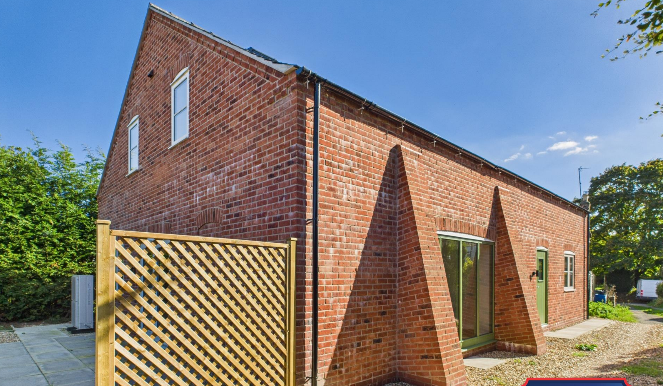
Coach House Church Road, Old Bolingbroke, Spilsby. PE23 4HF